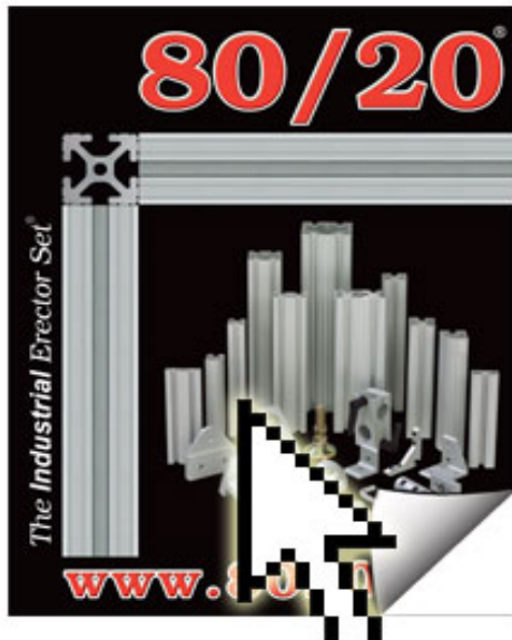
Metric & Imperial Sized Extrusion

You will be impressed with the latest addition to the www.8020.net Web site it's their interactive catalogue ! View the catalogue in a whole new way by jumping from one page to another with the click of your mouse.